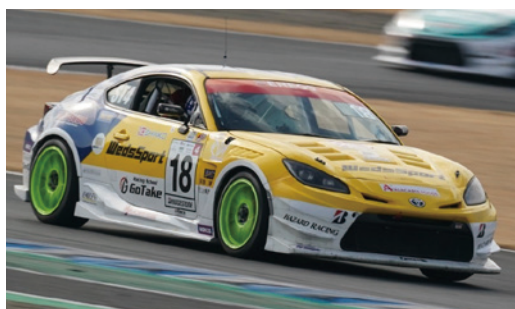
18 SUPER TAIKYU SERIES 2025 ST4 CLASS WedsSport GR86