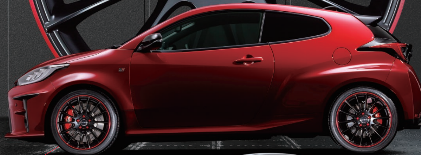
NEW SIZE DEBUT!!